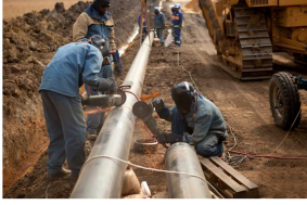
Titus 2 Teach